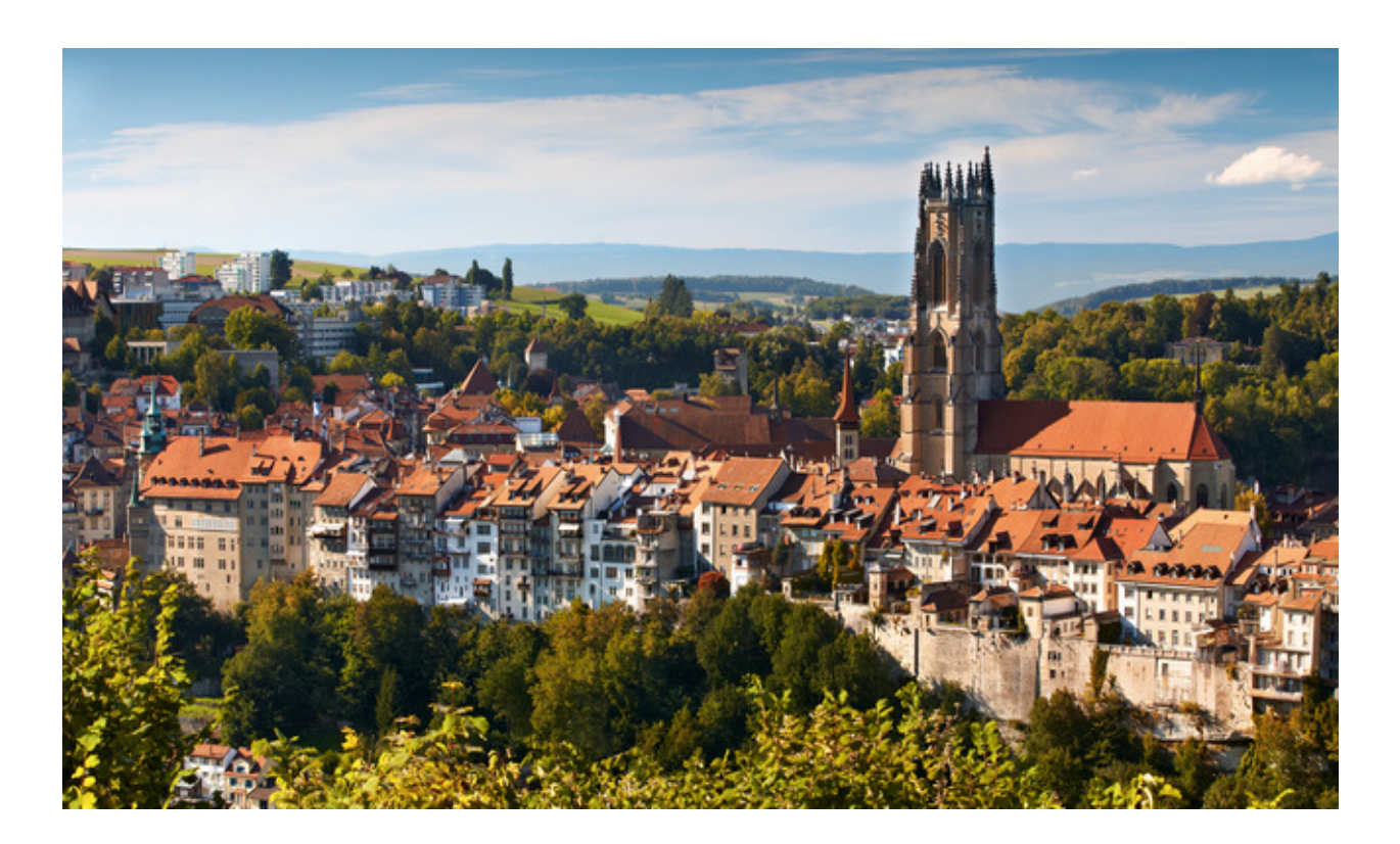
WELCOME TO FRIBOURG!